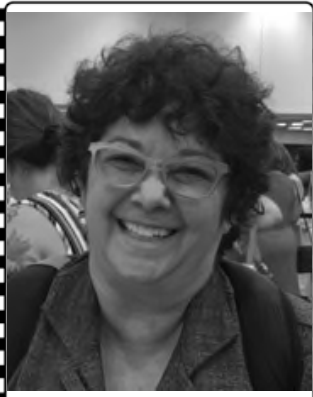
Highest Wholesale Order Jean Charter